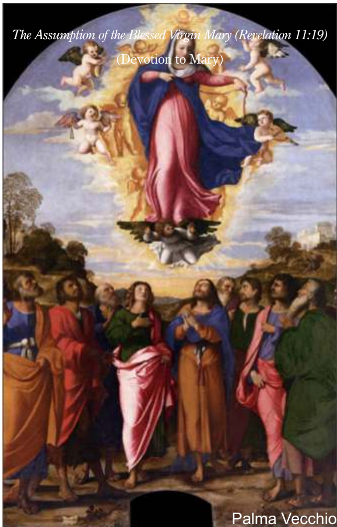
The Assumption of the Blessed Virgin Mary (Revelation 11:19) (Devotion to Mary)