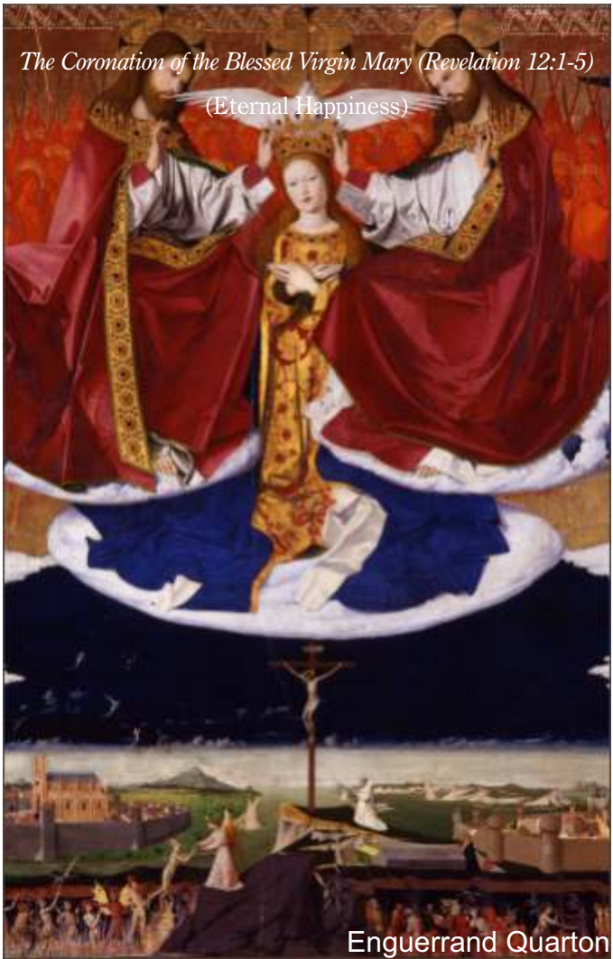
The Coronation of the Blessed Virgin Mary (Revelation 12:1-5) (Eternal Happiness)