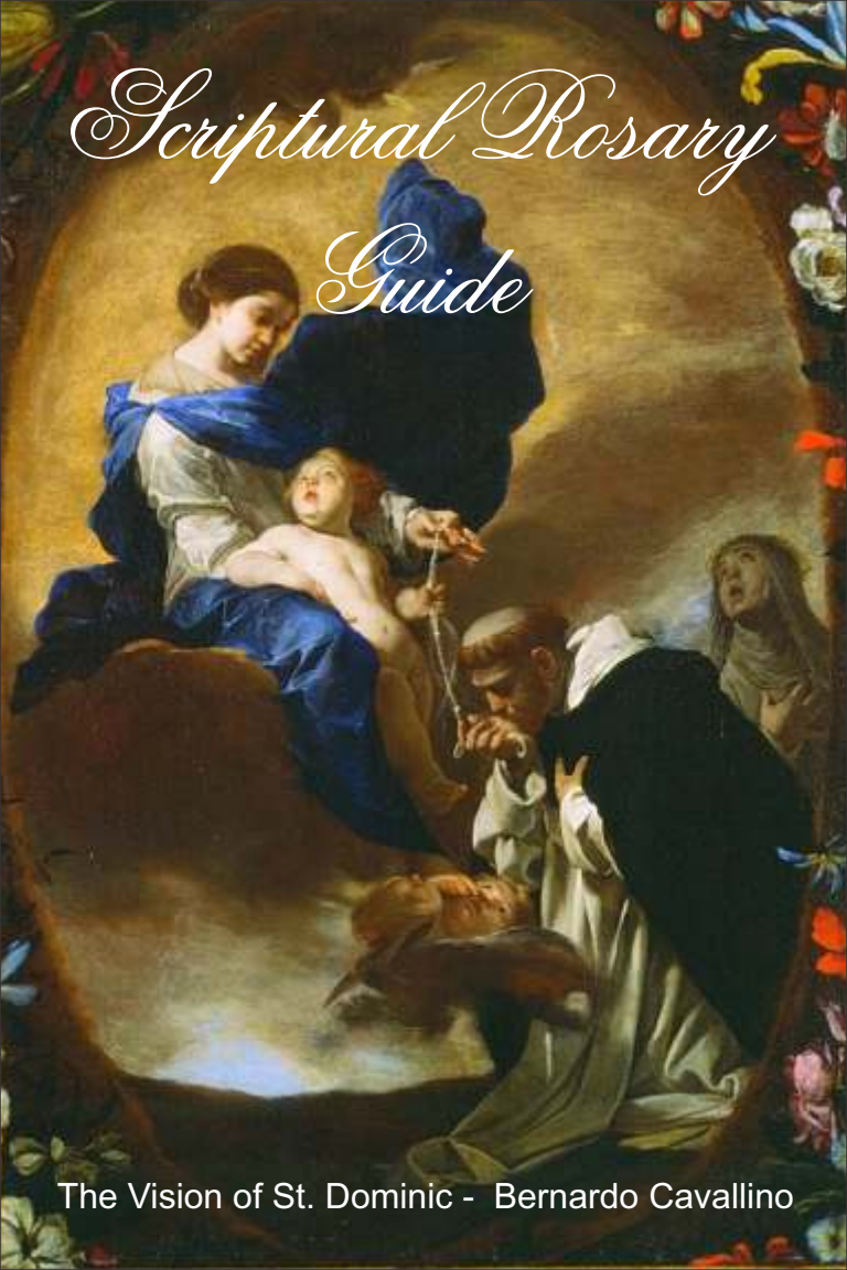
The Vision of St. Dominic - Bernardo Cavallino